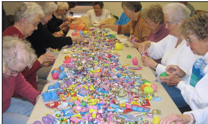
Residents volunteer to fill 1,000 Easter eggs for the holiday egg hunt.