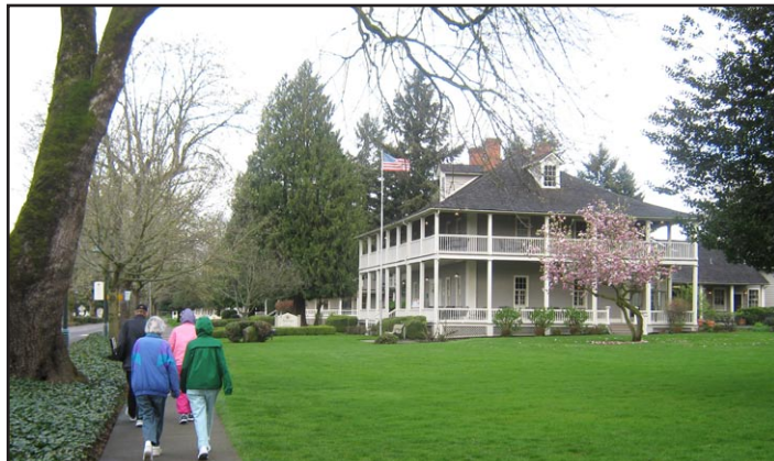
Stepping Out walking group walks by the The Restaurant at the Historic Reserve. Later, the group stopped for coffee at the Java House.