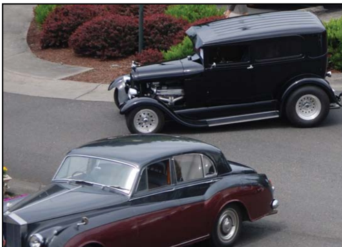
Approximately 36 cars packed the Waterford campus.