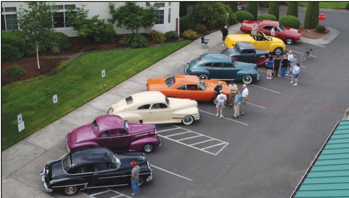
A colorful display of classic cars sits in the Waterford parking lot. Several car clubs, including Columbia River Camaro Club and the Oldsmobile Club of Oregon, showcased their vehicles at the event.