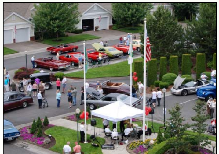
More than 800 people attended the Classic Car Show, which featured classic cars, entertainment, and a complimentary barbecue.