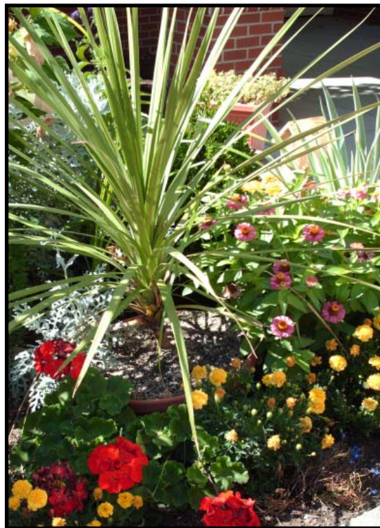
The Pembroke/Devonshire garden continues to bloom into fall.